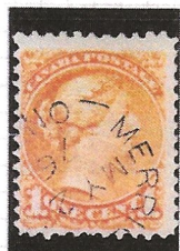
MERRICKVILLE, ONT MY/23/76 0.00360"