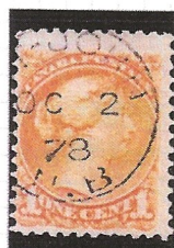
ST JOHN, NB OC/ 2/78 0.00365"