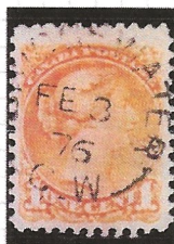
BRIDGEWATER, CW FE/ 3/76 0.00405"

Printing order # 37 Ordered December 15, 1875 2,000,000 stamps Colour Perforated PEU March 11, 1876