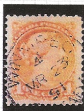
WINNIPEG CANADA MR/23/91 0.00335"