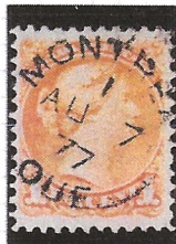
MONTREAL, QUE AU/ 7/77 0.00380"

Printing order # 45 Ordered June 8, 1877 2,000,000 stamps Colour Perforated Predicted earliest use September 3, 1877