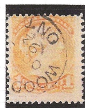
WOODSTOCK, ONT OC/ 5/92 0.00335"

Ordered June 6, 1892 10,000,000 stamps Pale orange-yellow Perforated 11.9 PEU September 1, 1892 Paper 19