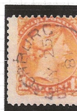
BEACHBURG, ONT JY/25/81 0.00365"