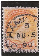
HAMILTON, CANADA AU/ 5/90 0.00305"

Ordered April 10, 1890 8,000,000 stamps Yellow Perforated 11.9 PEU July 6, 1890 Paper 19