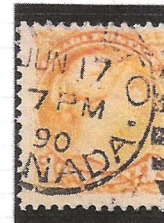
TORONTO, CANADA JUN/17/90 0.00300"

Printing order # 115 Ordered February 3, 1890 8,000,000 stamps Orange-yellow Perforated 11.9 PEU May 1, 1890 Paper 19