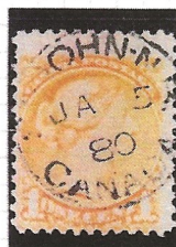
ST JOHN, NB, CANADA