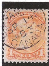
BELLEVILLE, ONT SP/14/83 0.00360"