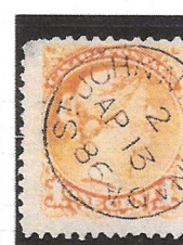
ST JOHN, NB, CANADA AP/13/86 0.00370"