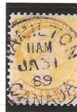
HAMILTON, CANADA JA/31/89 0.00345"