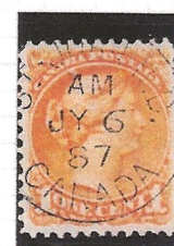
ST JOHN, NB, CANADA JY/ 6/87 0.00315"

Printing order # 103 Ordered February 1, 1887 9,000,000 stamps Orange-yellow Perforated 12.1 PEU April 29, 1887 Paper 15Hz.