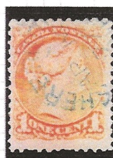
SHERBROOKE, QUE AP/14/77 0.00415"

Printing order # 42 Ordered December 5, 1876 2,000,000 stamps Pale orange Perforated 11.6 X 11.9 Predicted earliest use March 2, 1877 Paper 15Hz.