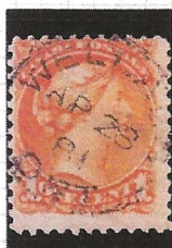
WELLAND, ONT AP/28/81 0.00385"

Ordered February 14, 1881 3,000,000 stamps Orange-yellow Perforated 11.6 X 11.9 Predicted earliest use May 12, 1881