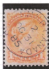
ST JOHN, NB, CANADA OC/31/85 0.00330"

Printing order # 96 Ordered October 2, 1885 6,000,000 stamps Orange-yellow Perforated 12.1 Predicted earliest use December 28, 1885