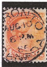
TORONTO, CANADA AU/10/86 0.00370"

Printing order # 99 Ordered April 17, 1886 8,000,000 stamps Deep orange-yellow Perforated 12.1 Predicted earliest use July 13, 1886 Paper 15Hz.