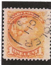
WOOLER, ONT NO/11/90 0.00340"

Ordered June 3, 1890 8,000,000 stamps Orange-yellow Perforated 11.9 Predicted earliest use August 29, 1890 Paper 19