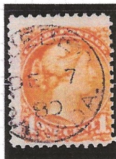
QUEBEC, CANADA DE/ 7/80 0.00380"

Ordered July 27, 1880 3,000,000 stamps Dull orange Perforated 11.6 X 11.9 PEU October 23, 1880 Paper 15Vt.