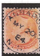
ANAPOLIS, NS MY/20/84 0.00335"

Ordered January 29, 1884 2,000,000 stamps Pale orange Perforated 12.1 Predicted earliest use April 25, 1884 Paper 15Hz.