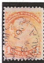
CANADA JA/10/84 0.00360"

Ordered November 7, 1883 4,000,000 stamps Orange-yellow Perforated 12.1 PEU February 2, 1884