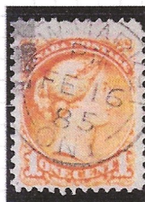
NEW-MARKET, ONT FE/16/85 0.00355"

Printing order # 90 Ordered December 5, 1884 5,000,000 stamps Colour Perforated Predicted earliest use March 2, 1885