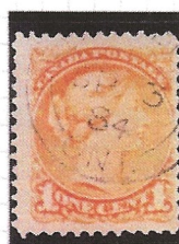
PETERBORO, ONT SP/ 3/84 0.00380"

Ordered June 14, 1884 6,000,000 stamps Yellow Perforated 12.1 Predicted earliest use Sept. 9, 1884 Paper 15Hz.