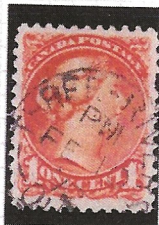
THREE RIVERS, QUE FE/10/72 0.00330"