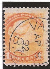
VANCOUVER, BC AP/ 8/92 0.00320"

Ordered November 7, 1891 20,000,000 stamps Orange-yellow Perforated 11.9 X 12.1 PEU February 2, 1892 Paper 19