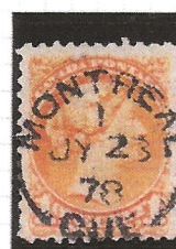
MONTREAL, QUE JY/23/78 0.00390"