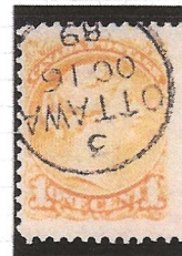
OTTAWA OC/16/89 0.00310"