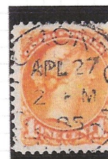
TORONTO, CANADA AP/27/85 0.00330"