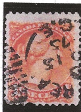
MONTREAL, CE NO/15/75 0.00345"