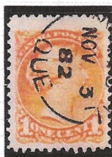
MONTREAL, QUE NOV/ 3/82 0.00380"