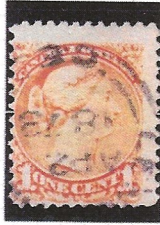
LENNOXVILLE, CE AP/ 2/73 0.00340"

Printing order # 17 Ordered December 11, 1872 1,000,000 stamps Pale orange Perforated 11.75 X 11.9 PEU March 8, 1873 Paper 14