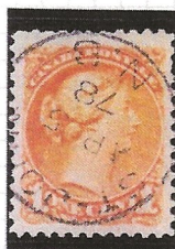
ST JOHN, NB AP/ 5/78 0.00370"