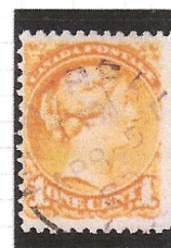
MONTREAL, CANADA APR/ 5/82 0.00375"