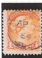
TH..., QUE AP/22/84 0.00340"

Ordered December 12, 1883 3,000,000 stamps Yellow-orange Perforated 12.1 PEU March 8 1884 Paper 15Hz.