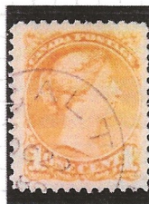
GALT, ONT OC/29/88 0.00335"