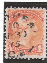
MONTREAL, CE AP/30/75 0.00365"