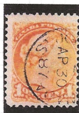
ST JOHN, NB, CANADA AP/30/87 0.00380"

Printing order # 102 Ordered November 5, 1886 8,000,000 stamps Pale orange-yellow Perforated 12.1 Predicted earliest use January 31, 1887 Paper 15Hz.