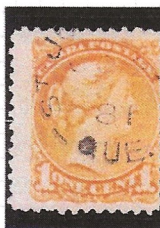
ST-JOVITE, QUE OC/26/81 0.00370"

Ordered August 25, 1881 3,000,000 stamps Yellow Perforated 12.1 X 11.9 Predicted earliest use November 20, 1881