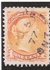
ONT FE/ 6/77 0.00440

Printing order # 41 Ordered October 16, 1876 2,000,000 stamps Orange-yellow Perforated 11.6 X 11.9 PEU January 12, 1877 Paper 15Hz.