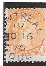
MONTREAL, QUE NO/16/76 0.00355"

Printing order # 41 Ordered October 16, 1876 2,000,000 stamps Orange-yellow Perforated 11.6 X 11.9 PEU January 12, 1877 Paper 15Hz.