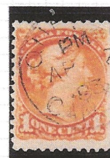
QUEBEC, CANADA AP/ 7/83 0.00375"