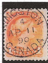
KINGSTON, CANADA AP/11/90 0.00315"

Printing order # 114 Ordered November 20, 1889 8,000,000 stamps Yellow-orange Perforated 11.9 X 12.1 Predicted earliest use February 15, 1890 Paper 19