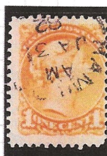
HAMILTON, ONT JA/31/82 0.00365"