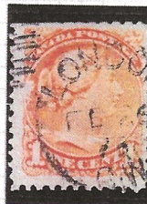
LONDON, CW FE/26/75 0.00385"