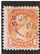
SUSSEX VALE, NB JY/ 6/86 0.00415"

Printing order # 98 Ordered January 30, 1886 4,000,000 stamps Pale orange-yellow Perforated 12.1 PEU April 27, 1886 Paper 15Hz.