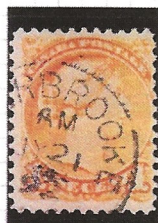
SHERBROOKE JY/21/92 0.00330"

Ordered March 16, 1892 6,000,000 stamps Yellow-orange Perforated 11.9 X 12.1 Predicted earliest use June 11, 1892 Paper 19