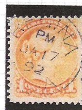
REGINA, ASSA JA/17/92 0.00325"

Ordered August 11, 1891 10,000,000 stamps Pale orange-yellow Perforated 11.9 X 12.1 PEU November 6, 1891 Paper 19