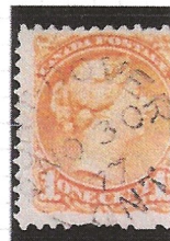
PORT DOVER, ONT NO/30/77 0.00350"