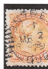
MONTREAL, QUE MR/ 2/79 0.00380"