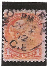
MONTREAL, CE JY/ 8/72 0.00290"