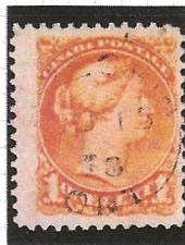
BRECHIN, ONT JU/15/88 0.00350"