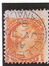
BELLEVILLE, CANADA JY/30/84 0.00330"

Ordered April 21, 1884 4,000,000 stamps Orange-yellow Perforated 12.1 PEU July 17, 1884 Paper 15Hz.