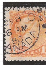
TORONTO, CANADA NOV/ 8/86 0.00340"

Printing order # 100 Ordered June 26, 1886 4,000,000 stamps Orange-yellow Perforated 12.1 PEU September 21, 1886 Paper 15Hz.