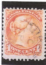
QUEBEC, CE SP/17/72 0.00310"