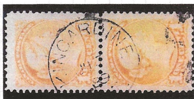
KINCARDINE, ONT JU/ 7/89 0.00295"