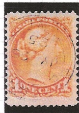
PETERBORO, ONT JY/28/85 0.00365"

Printing order # 92 Ordered March 11, 1885 4,000,000 stamps Pale orange-yellow Perforated 12.1 PEU June 6, 1885 Paper 15Vt.