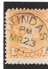
DUNDAS, ONT MR/23/81 0.00310"

Ordered November 19, 1880 2,000,000 stamps Yellow Perforated 12.1 X 11.9 PEU February 14, 1881 Paper 15Hz.