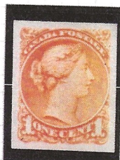
PLATE PROOF ON INDIA

After five orders of one cent Large Queens a decision was taken to reduce the stamp size from 20 X 25 mm to 18 X 22 mm that is from Large Queen to Small Queen. The 1¢ small Queen could pay the rate for: - Domestic drop letter, no weight limit 1859/AP/01 – 1875/SE/30; - Circulars, Prices Current etc. (3 rd class mail) to Canada, PEI, NF or USA, 1¢/oz. 1868/AP/01 – 1873/JY/15; - Periodicals when mailed by publisher one cent per four ounces 1870/JA/01 – 1897/JU/18; - Newspapers when mailed by publisher one cent per pound, bulk rate 1870/JA/01 – 1897/JU/18; - Domestic Post Cards one cent each 1871/JU/01 – 1915/AP/14.