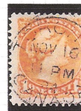
TORONTO, CANADA NO/16/84 0.00385"

Ordered August 10, 1884 6,000,000 stamps Dull orange Perforated 12.1 PEU November 5, 1884 Paper 15Hz.