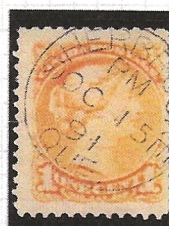
SHERBROOKE, QUE OC/15/91 0.00320"

Ordered May 1, 1891 10,000,000 stamps Pale yellow Perforated 11.9 X 12.1 PEU July 27, 1891 Paper 19