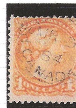
PETERBORO, CANADA MR/ 3/84 0.00360"

Ordered December 12, 1883 3,000,000 stamps Yellow-orange Perforated 12.1 PEU March 8 1884 Paper 15Hz.