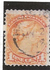
HAMILTON, ONT MY/27/72 0.00280"