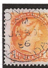
LONDON, CANADA JA/30/86 0.00350"