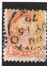
TORONTO, ONT JY/15/76 0.00400"