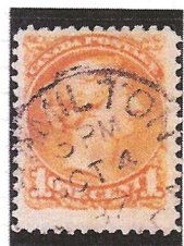
HAMILTON, CANADA OC/ 4/87 0.00380"