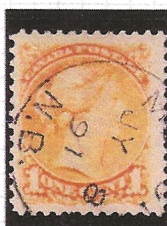
MONCTON, NB JY/ 8/91 0.00325"

Ordered February 4, 1891 8,000,000 stamps Pale orange-yellow Perforated 11.9 PEU May 2, 1891 Paper 19