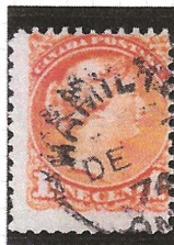
HAMILTON, ONT DE/ 7/74 0.00380"

Printing order # 30 Ordered September 23, 1874 2,000,000 stamps Pale orange Perforated 11.6 X 11.75 Predicted earliest use December 19, 1874