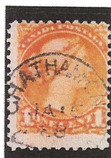
CHATHAM, ONT, CANADA JA/16/88 0.00315"