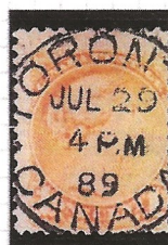
TORONTO, CANADA JUL/29/89 0.00325"