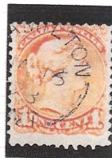
HAMILTON, ONT JA/16/73 0.00325"