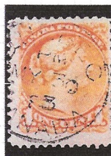
QUEBEC, CANADA MY/30/83 0.00355"

Printing order # 78 Ordered March 5, 1883 5,000,000 stamps Colour Perforated Predicted earliest use May 31, 1883