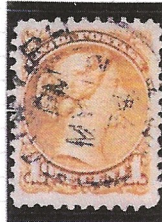
GUELPH, ONT MY/12/74 0.00345"