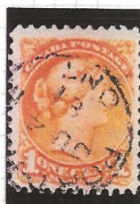
PORT HOPE, ONT JU/ 4/81 0.00370"