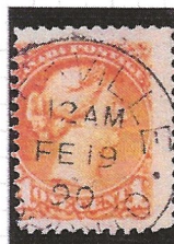
YORKVILLE, TORONTO FE/19/90 0.00310"

Printing order # 113 Ordered September 10, 1889 5,000,000 stamps Dull orange Perforated 11.9 X 12.1 PEU December 6, 1889 Paper 19