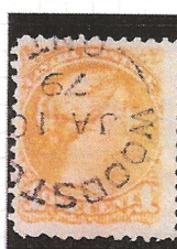
WOODSTOCK, ONT JA/10/79 0.00395"