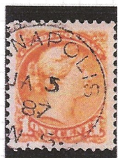
ANNAPOLIS, NS JA/ 5/87 0.00350"

Printing order # 101 Ordered August 28, 1886 2,000,000 stamps Deep orange-yellow Perforated 12.1 PEU November 23, 1886 Paper 15Hz.