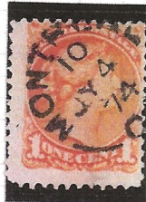
MONTREAL, CE JY/ 4/74 0.00340"

Printing order # 28 Ordered May 16, 1874 2,000,000 stamps Yellow-orange Perforated 11.6 X 11.9 PEU August 11, 1874