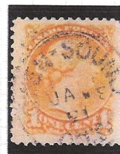
OWEN SOUND, ONT JA/ 8/91 0.00335"

Ordered September 1, 1890 6,000,000 stamps Chrome yellow Perforated 11.9 PEU November 27, 1890 Paper 19