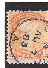
OTTAWA, CA AU/ 7/83 0.00345"