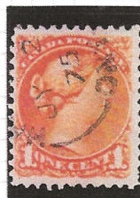
HAMILTON, ONT JY/ 2/75 0.00365"

Printing order # 34 Ordered May 20, 1875 2,000,000 stamps Colour Perforated PEU August 15, 1875