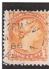
HAMILTON, CANADA MY/15/88 0.00300"