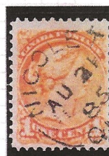
NICOLET, QUE AU/21/85 0.00335"

Printing order # 93 Ordered May 5, 1885 4,000,000 stamps Orange-yellow Perforated 12.1 Predicted earliest use July 31, 1885 Paper 15Vt.