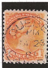
QUEBEC, CANADA JA/26/81 0.00375"

Ordered September 30, 1880 4,000,000 stamps Yellow-orange Perforated 11.9 Predicted earliest use December 26, 1880 Paper 15Hz.