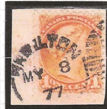
HAMILTON MY/ 8/77

Printing order # 43 Ordered January 22, 1877 3,000,000 stamps Dull orange Perforated 11.6 X 11.9 PEU April 19, 1877 Paper 15Hz.