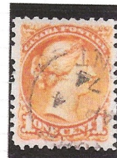
YORK, ONT AP/ 4/74 0.00355"

Printing order # 25 Ordered January 5, 1874 1,000,000 stamps Orange-yellow Perforated 11.6 X 11.9 PEU April 2, 1874 Paper 11