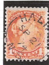
HALIFAX, NS SP/21/74 0.00385"

Printing order # 29 Ordered July 25, 1874 2,000,000 stamps Deep orange Perforated 11.6 X 11.9 PEU October 20, 1874