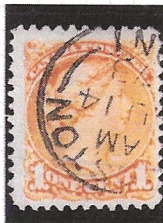
KINGSTON, ONT AU/14/73 0.00370"