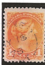
STAYNER, ONT MY/18/78 0.00360"