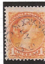
YORKVILLE, ONT, CANADA JY/31/82 0.00390"