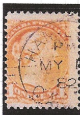
HAMILTON, ONT MY/01/82 0.00340"

Printing order # 72 Ordered February 20, 1882 4,000,000 stamps Colour Perforated Predicted earliest use May 18, 1882