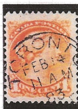
TORONTO, ONT FE/14/83 0.00325"